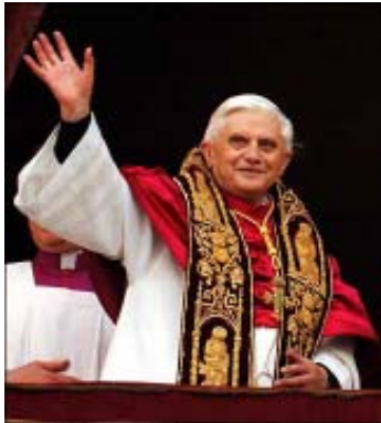
Pope Benedict XVI