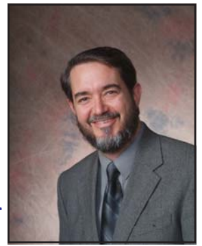
Dr. Scott Hahn