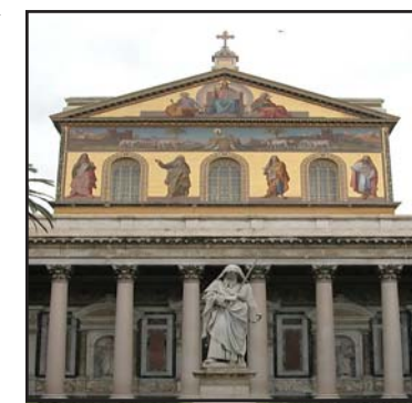
St. Paul Outside the Walls