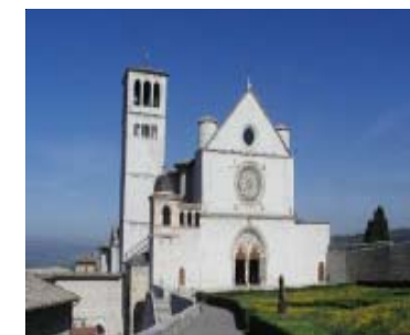
Basilica of St. Francis