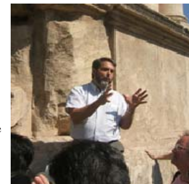
Dr. Scott Hahn