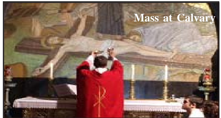
Mass at Calvary