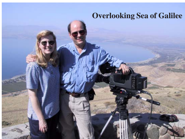
Overlooking Sea of Galilee

We personally invite you to join us on this trip of a lifetime!