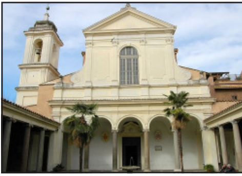
San Clemente Church