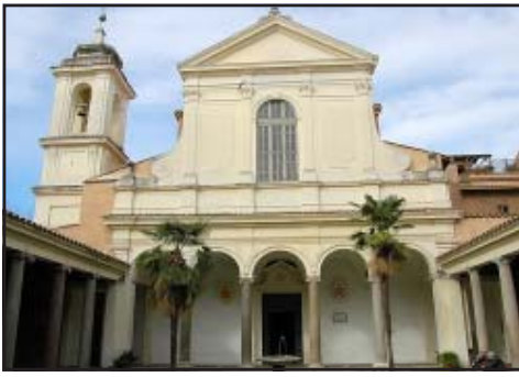
San Clemente Church