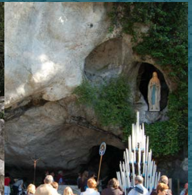
Grotto of Lourdes