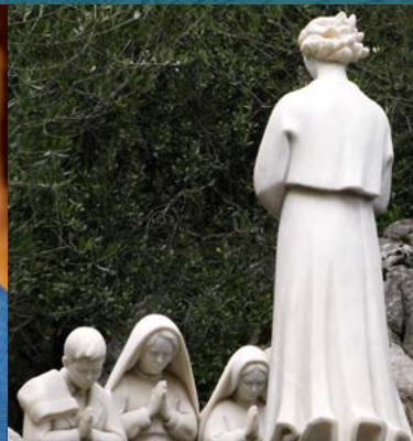
Shepherd Children Fatima