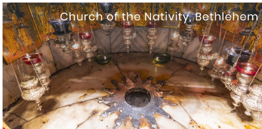
Church of the Nativity, Bethlehem