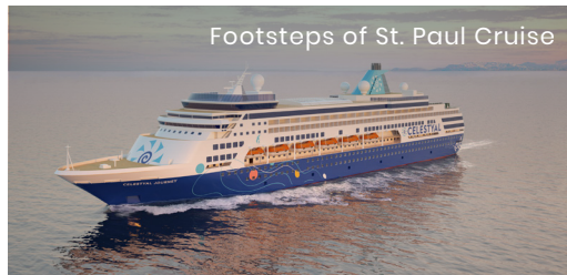
Footsteps of St. Paul Cruise