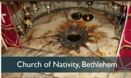
Church of Nativity, Bethlehem