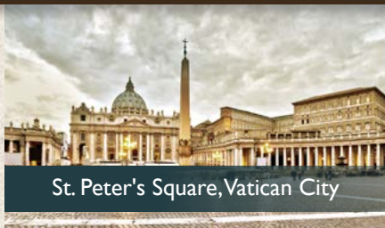
St. Peter's Square, Vatican City

For updates, changes and new trips please visit our website at www.FootprintsofGod.com or call Corporate Travel at 800.727.1999