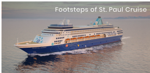
Footsteps of St. Paul Cruise