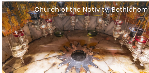
Church of the Nativity, Bethlehem