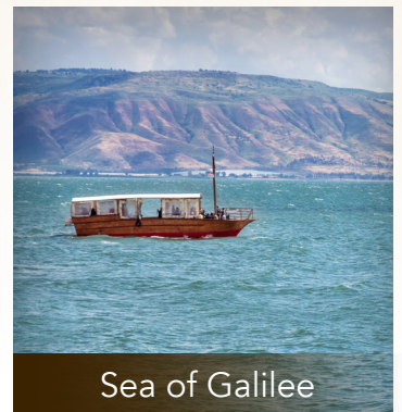
Sea of Galilee