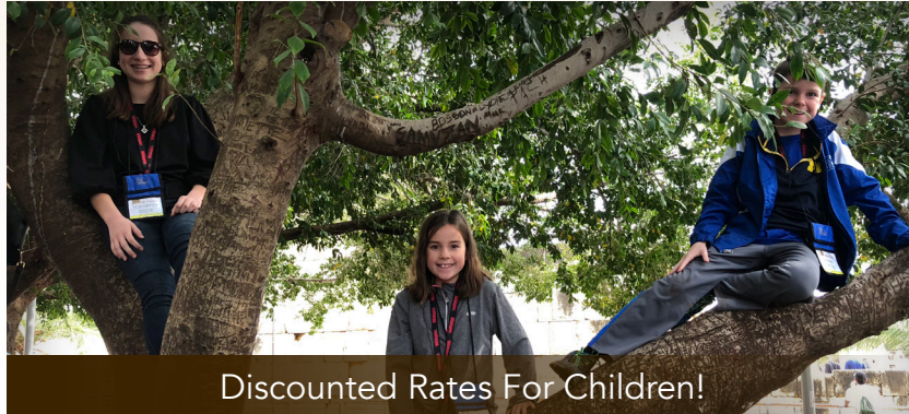
Discounted Rates For Children!